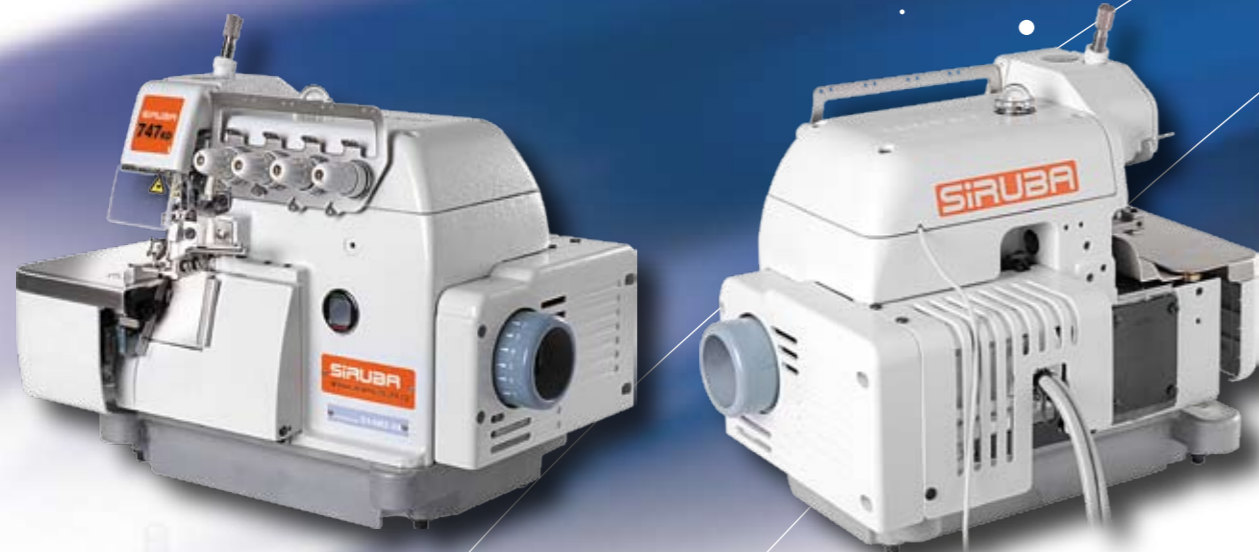
• 700KD with LED device